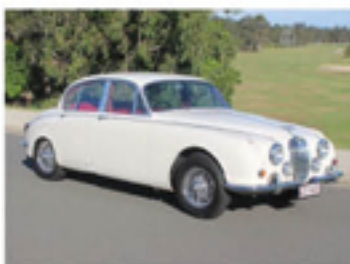
1968 Jaguar 240 MkII - single family ownership from new. Rare manual with wire wheels & power steering. Rolling restoration recently completed, big $ spent. Presents & drives beautifully. Reg 237 GOI $32,500