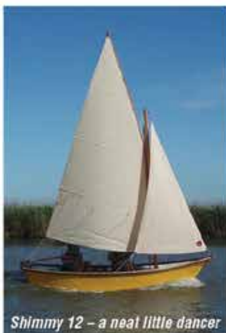
Shimmy 12 – a neat little dancer

Their smallest, the ever popular Shimmy 12 has its roots in small 19th century workboats of the Mediterranean and their brand new Secret 33 (love the name) is unashamedly Art Deco in its aesthetics and true to the spirit of tradition, it sports super efficient electric motors and an array of solar panels on the roof. The new launch carries up to 16 people in silent sustainable