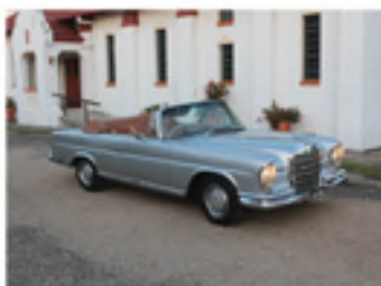
1964 Mercedes Benz 220SEb Cabriolet - rare factory RHD cabriolet (1 of only 192 cars built) in stunning condition. Has a thick history file. Mercedes Benz style and elegance personified. Reg 164 MBZ $179,500