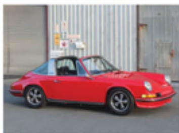
1972 Porsche 911S 2.4 Targa - highly sought after early 911. This car is an older restoration that still presents as 'stunning' today. Could easily be brought up to concours. Books and tools. Unreg NEW PRICE $239,500