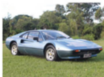
1977 Ferrari 308 GTB 'Vetroresina' - Australian delivered factory RHD example. Stunning colour combination. Fabulous looking car that drives even better! Books and tools. Reg 190 LEW $235,000