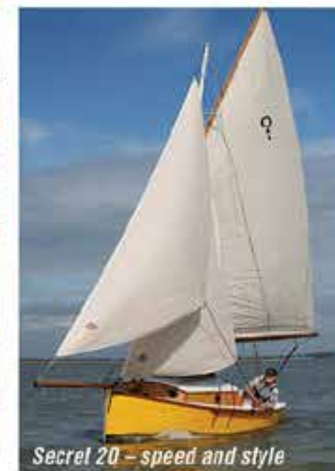
Secret 20 – speed and style

Secret 33 solar electric launch has arrived in style