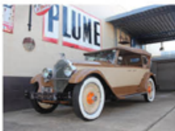
1926 Packard Six 326 Phaeton - RHD. Although an older restoration the car presents and drives superbly. Just a stunning example. Reg Q1623 $79,500