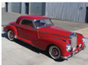
1953 Mercedes Benz 300S Coupe - (1 of 216 built), predecessor to & more expensive than a Gulwing new! From deceased estate & recently reassembled, retitled & the engine rebuilt. Unreg NEW PRICE $469,500