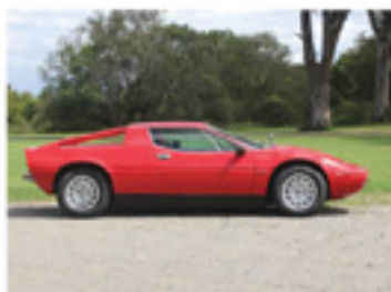
1974 Maserati Merak - factory RHD, fully matching numbers and original colours. A very correct and undisturbed example. Drives really well. Great value compared to period Ferraris and Porsches. Unreg $199,500