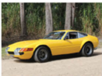
1977 Ferrari 365 GTB/4 Daytona Group IV Recreation - built on Ferrari 400 Chassis, all Ferrari mechanicals. Fibreglass body from original EG Autokraft moulds. Six year project just complete. Unreg $225,000