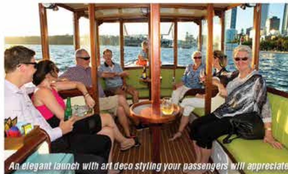
An elegant launch with art deco styling your passengers will appreciate