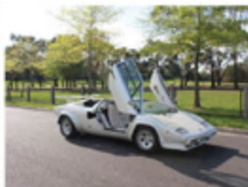
1985 Lamborghini Countach LP5000 QV - rare factory RHD. Pearl white / white. Only 35,000km. Well sorted example with known history from new. Enthusiast owner. Unreg $750,000