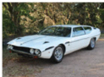
1969 Lamborghini Espada Series 1 - very rare early Espada, most likely the only S1 in Australia. Fully matching numbers, original colours. An incredible time capsule and the big debate is whether to preserve or restore. The car runs and drives well. Unreg $ Enquire