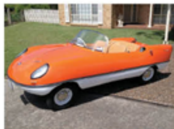
1959 Goggomobil Dart 400cc - G O G O O... but YES it is the Dart! A lovely example of this very rare and collectible micro car. An iconic piece of Australian motoring history! Whilst an older restoration the car presents and drives beautifully. Unreg $39,500