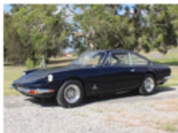
1970 Ferrari 365 GT 2+2 - a lovely original example of this classic Ferrari. Factory RHD, matching numbers with books and tools. Out of long term ownership just serviced and new Michelin KIXX tyres fitted. Unreg $ Enquire