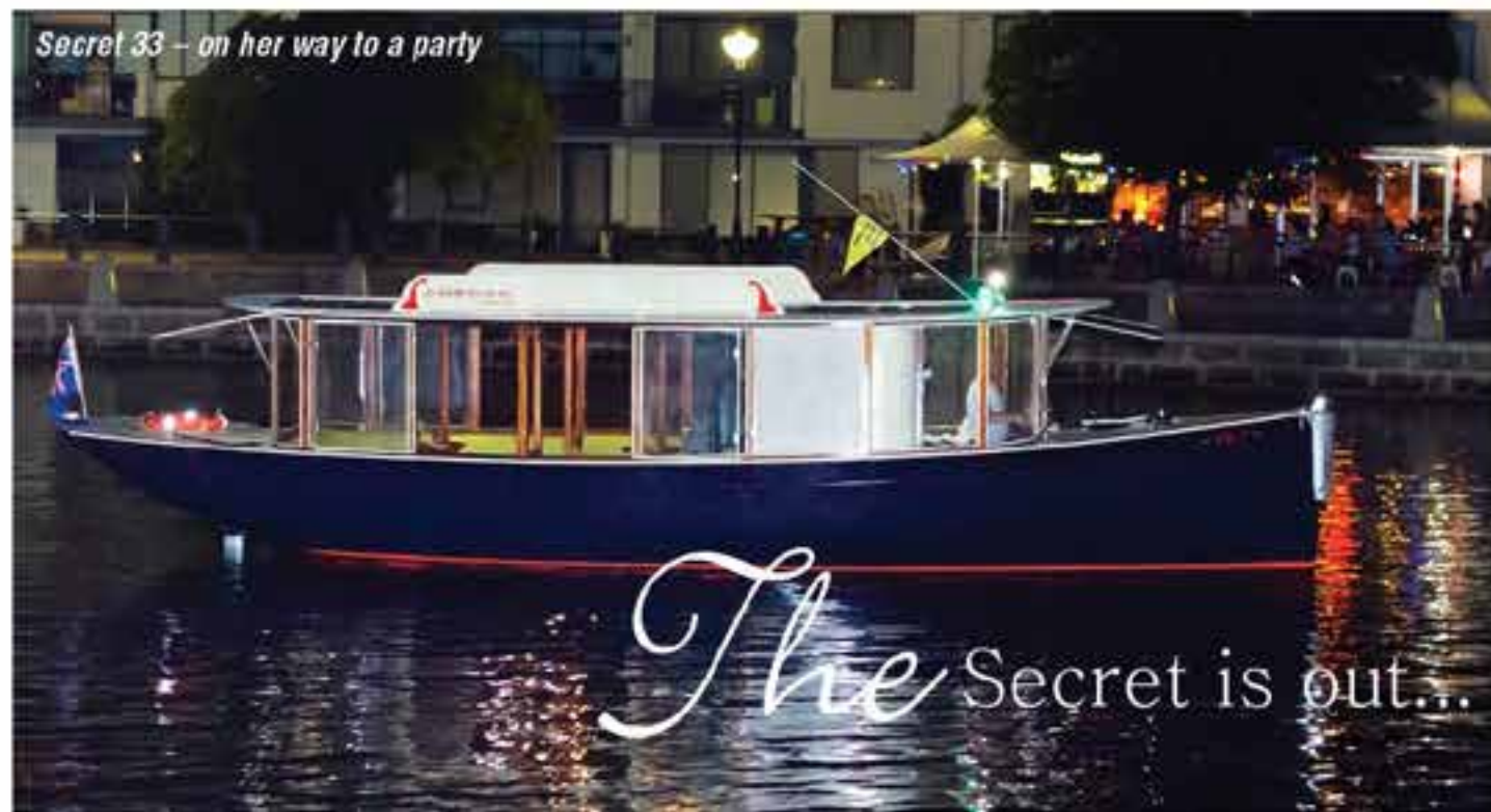
Secret 33 – on her way to a party