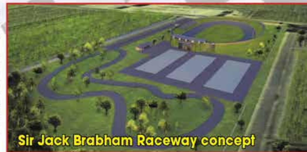
Sir Jack Brabham Raceway concept